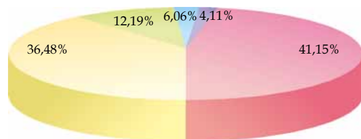
Fig. 4. Allocation of funds in 2007-2013 under RDP