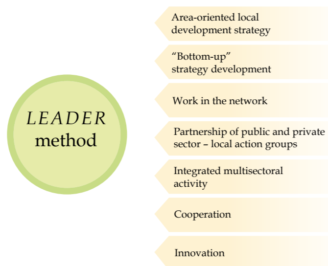
Fig. 1. Main LEADER elements

Those principles are united by the strategic planning principle. Rural welfare should be achieved by consistent and systematic foreseeing of the most important development goals in a particular area (Fig. 1).